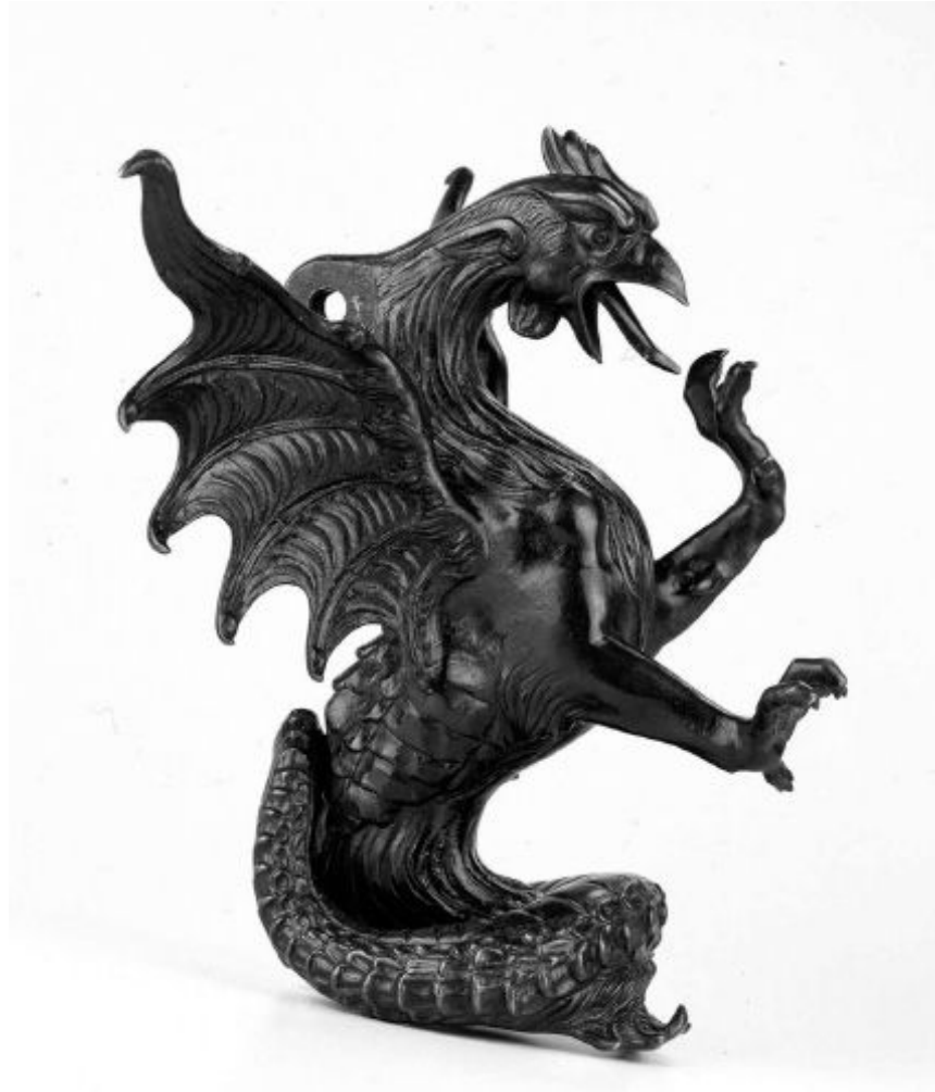
The Basilisk is known as the god of healing

Alchemists searched for this dragon, because they believed its ashes mixed with human blood and reddish hair could create the anti-venom (medication) as well as gold. The basilisk was known in its spiritual form as the king of the serpents . From thereon we will always find serpents associated with medicine. It's not by happenstance that satan, incited the first couple to eat from the tree of good and evil using the form of a serpent.