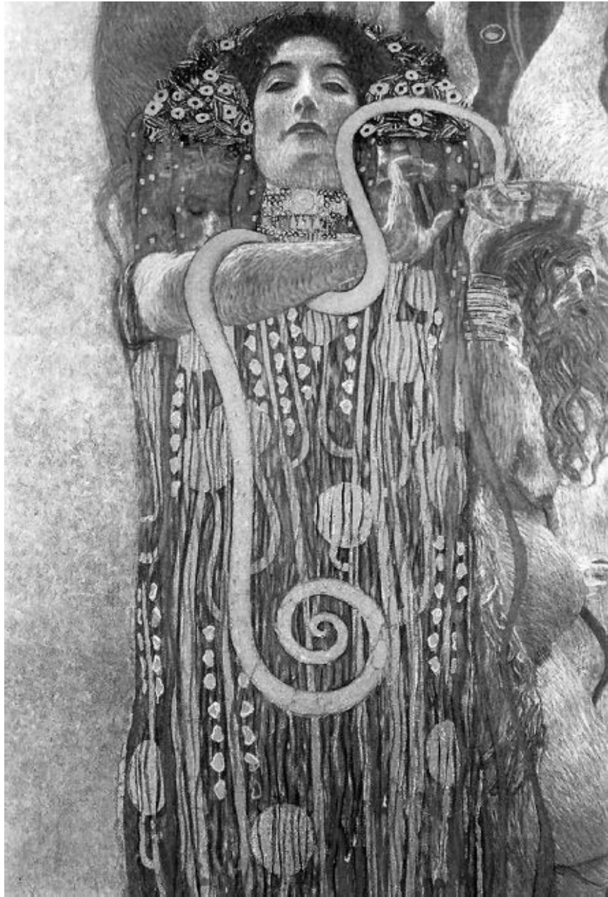
Hygeia "Medicine" Picture by Gustav Klimt