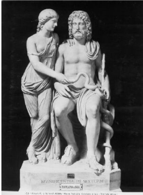
Hygieia with Asclepius

Now, let's see the influence of all these gods and their spells on modern day medicine.