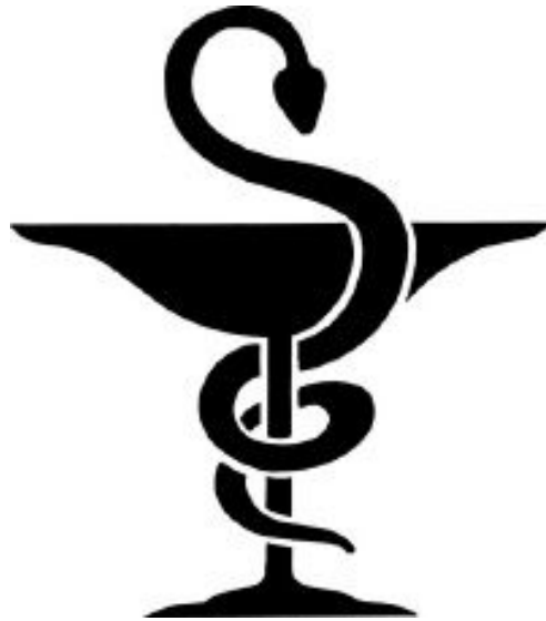
Serpent with bowl

Her image is always accompanied by a serpent coiled to her arm drinking from a bowl. This symbol is everywhere in hospitals and pharmacies, together with that of Asclepius. To further certify her relationship with occultism, in some countries such as Germany, a druid rune was added to the pharmaceutical symbol.