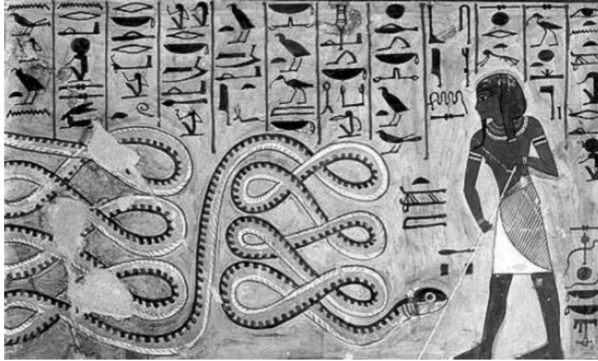
Egyptian Serpent in the underworld

The Emerald Tablet, or Hermetic, from Hermes Trismegistus (only known through Greek and Arab translations), is normally considered the basis of philosophy and western alchemic practices, called by its first followers Hermetic philosophy.