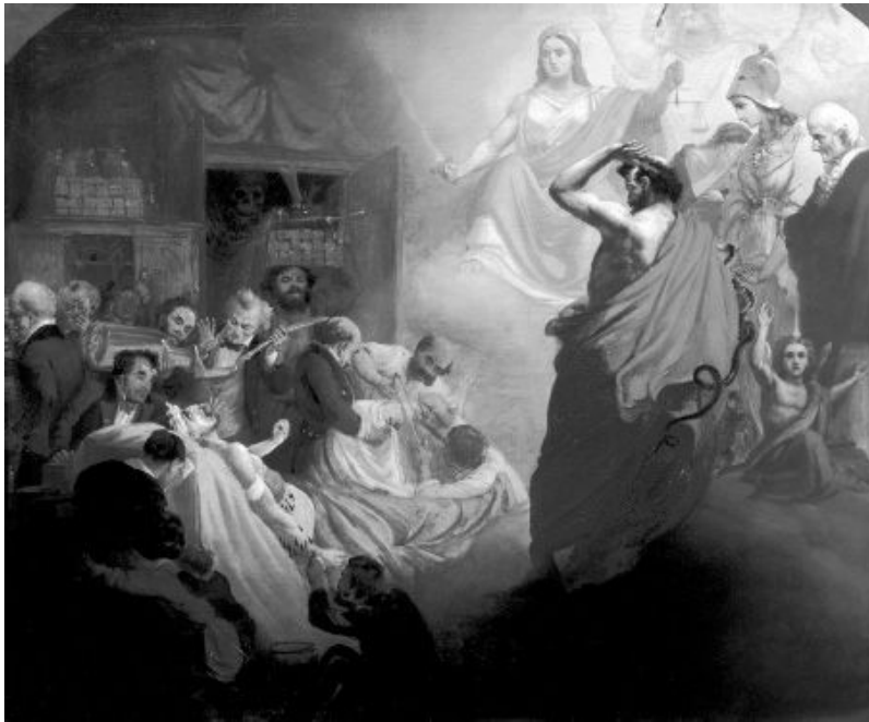
Allegorical painting by Alexander Egorovich Beideman (1857) showing the horror with which Homeopathy and Samuel Hahnemann view the medicine of that time period.

A human being trying to heal, what is a divine design, is the same as a six year old child trying to repair the electronic and mechanical systems of a Boeing 787 Jet. The only thing the kid would succeed at is joining two cables and rejoicing over the little sparks it made as it broke down the systems.