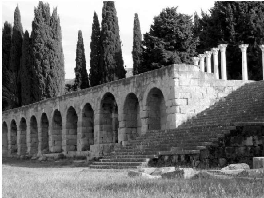
Temple of Asclepion

The sick would then speak to a temple priest, who analyzed the method of cure. During the whole time of the treatment, the patient would stay in a guest room. As a part of the therapy, they had theatre and entertainment.