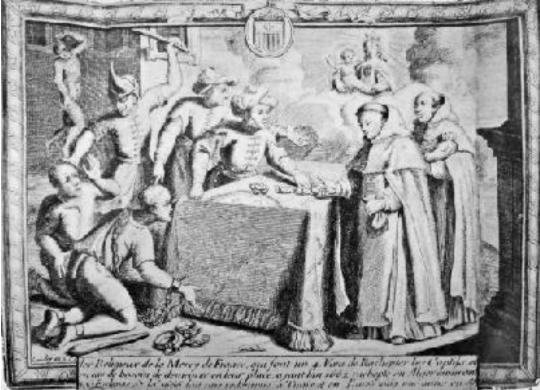
Image: The redemption (buying back) of Christian captives by Mercedarian monks in the Barbary states.