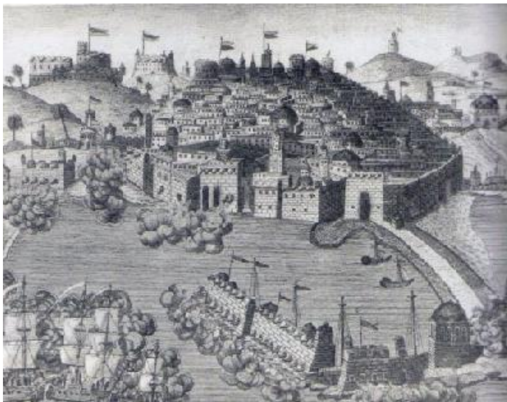
Image: The bombardment of Algiers in 1682, by Abraham Duquesne.