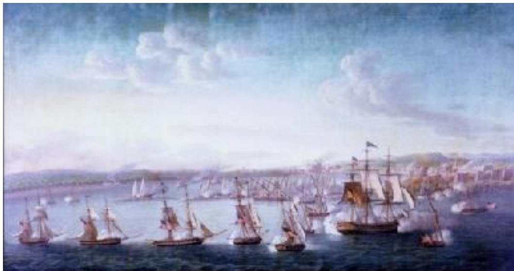
Image: A US Navy expedition under Commodore Edward Preble engaging gunboats and fortifications in Tripoli, 1804.