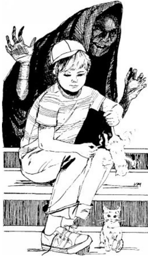
Artist's concept of the form and shape of the mystery demon.

However, when the personality of the mystery demon is displayed, it is not always obvious. When the mystery demon exhibits his personality in a human he has possessed, it is usually revealed as a hidden personality in that possessed human. For example, there was once a man who lived a good, clean, Christian life. He was a good husband, a good father, a law-abiding citizen, and he took an active part in his church. After this man died, his wife of forty years found some things he had kept hidden from her throughout their entire married life. He had prepared a little room hidden away in the back of his workshop. This room was private and when he was not in it, he kept it locked. After his death, his wife found many obscene objects and pictures hidden in that room. This man had a hidden personality that not even his life-long mate knew about.